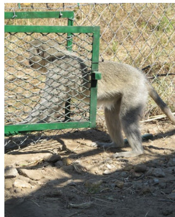
Frenchie went out into Engeltjie enclosure