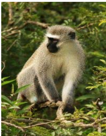
ET was integrated into Gismo troop