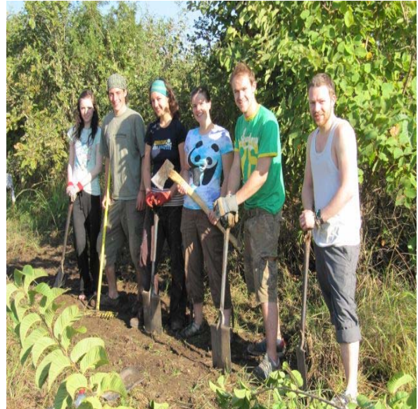
Volunteers painting and digging for the erection of the new one hectare enclosure

The following enclosure upgrades were completed in 2010: