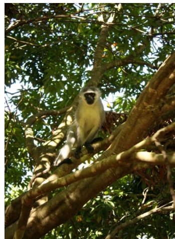
Gerrard being released back into the wild 3 weeks after he arrived with head injuries