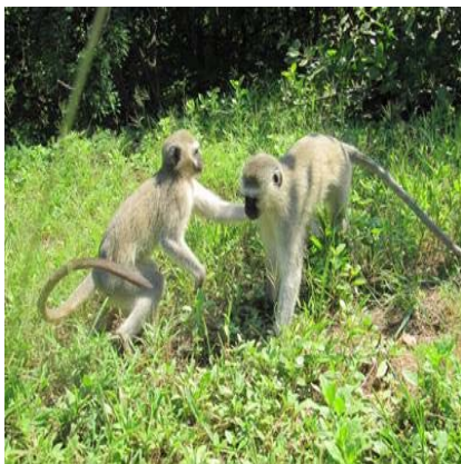
Tweedledee & Tweedledum were integrated into Skrow troop