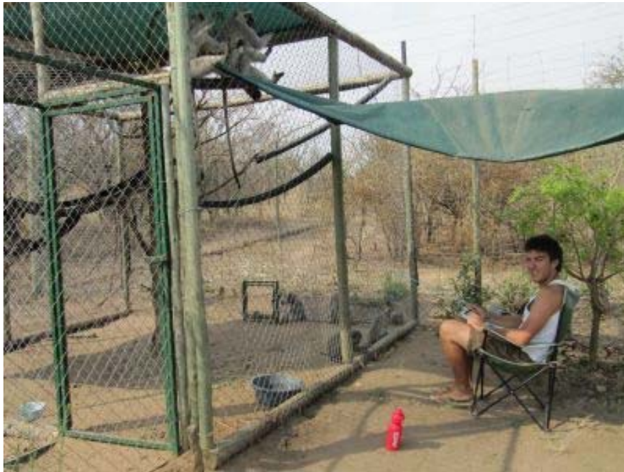
Volunteer helping with integrations of Shasta into Engeltjie troop