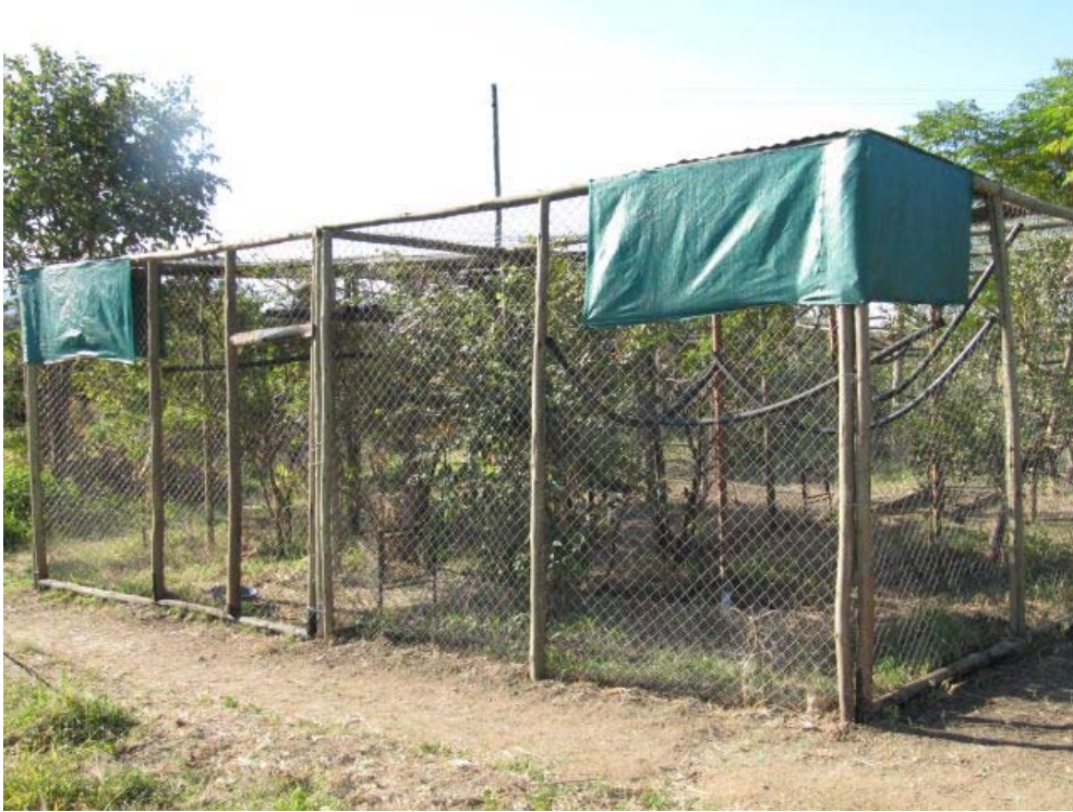
The new Bachelor Block houses 5 adult males