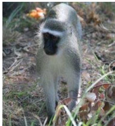
Scat was integrated into the James enclosure