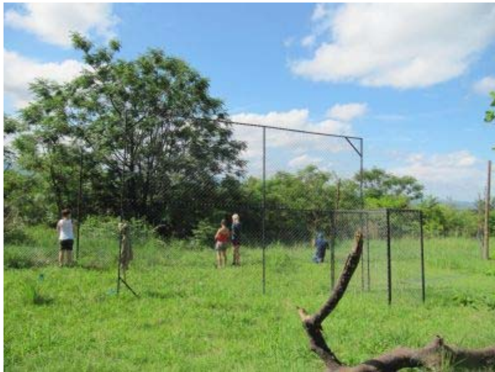
Construction of the new orphan enclosure