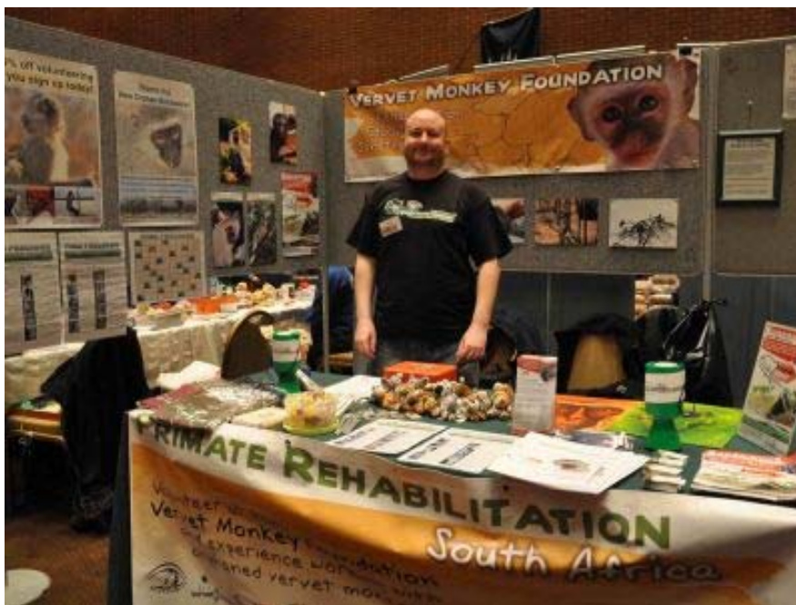
The Foundation attended the Kensington Animal Charities Fair, UK

Kensington Animal Charities Fair, UK, Dec