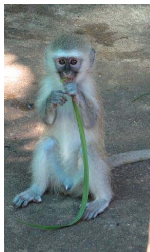
Forest Gump - one of the orphans waiting to go into the new enclosure

Construction of the new one hectare orphan enclosure was nearing completion at the end of 2010 and the 13 juveniles will be moved into their new natural environment at the beginning of 2011. The enclosure will provide sanctuary to numerous other monkeys that arrive at the centre allowing them to live as natural an environment as possible.