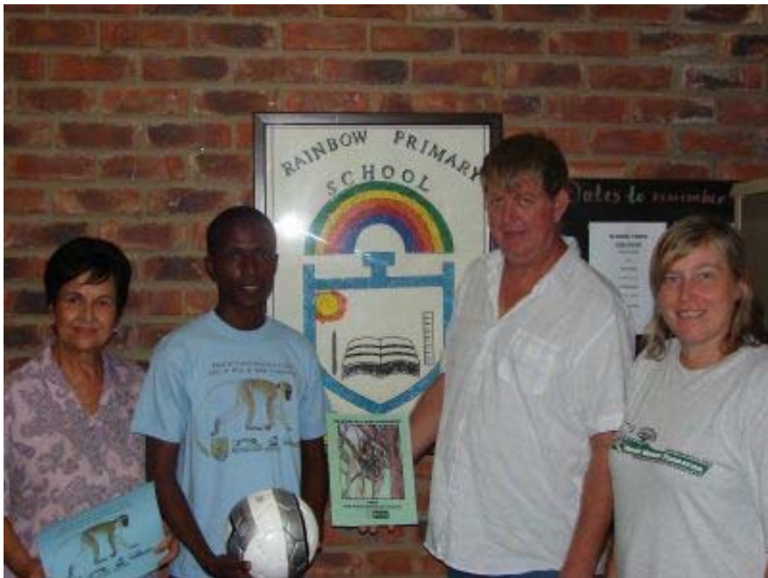
Soccer uniforms & kit were presented to a local school as part of an education initiative

Thank you to all who supported / granted the soccer uniform initiative – USFWS, PASA, Conservation International and Brevard zoo. A soccer game was filmed between Rainbow combined school and the Meridian High School Team.