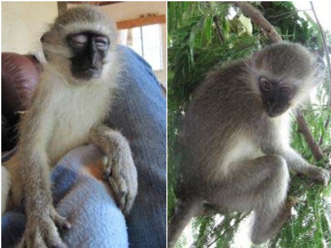
Left: Scritch (a male juvenile) was hit by a car and arrived unconscious. Right: Scritch a few weeks later regaining his balance.

Four monkeys were brought in as a direct result of car accidents, two survived and two were euthanased due to the seriousness of their injuries.