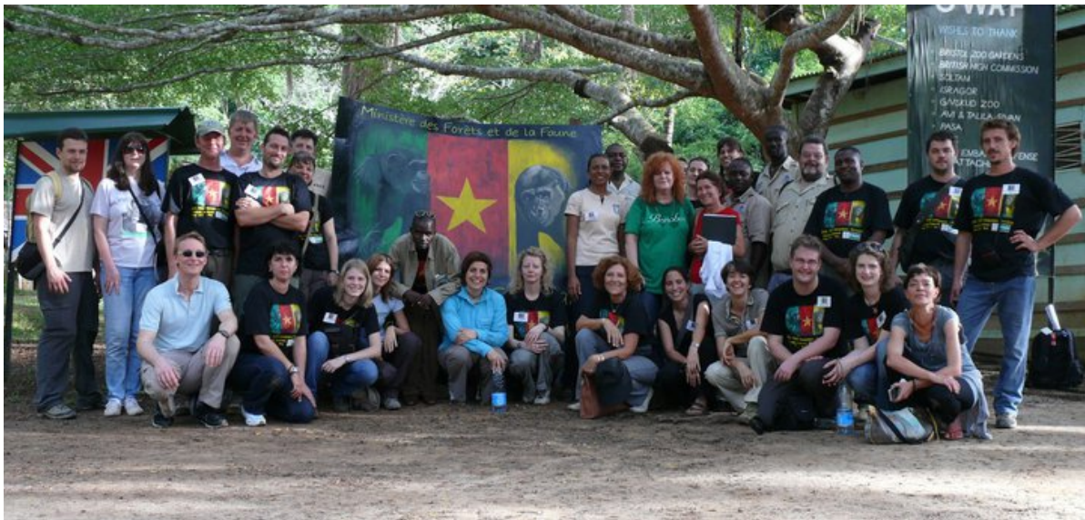
PASA MANAGEMENT CONFERENCE – Yaounde, Cameroon

Further information can be found at www.pasaprimates.org